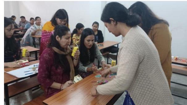
Workshop on Book Mark Making