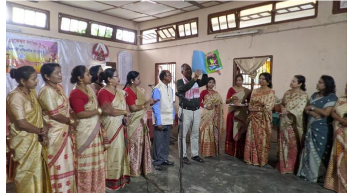
Inauguration of Hand Written Magazine "Oikyom"