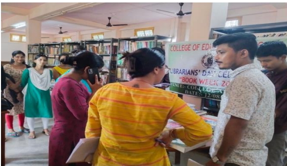
Celebration of Book Week