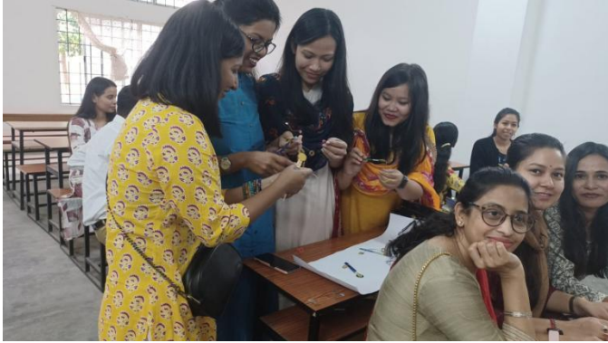
Workshop on Book Mark Making