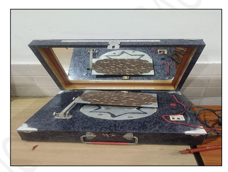
SNAPSHOTS OF MAZE LEARNING APPRATUS (ELECTRICAL) & MIRROR DRAWING APPRATUS