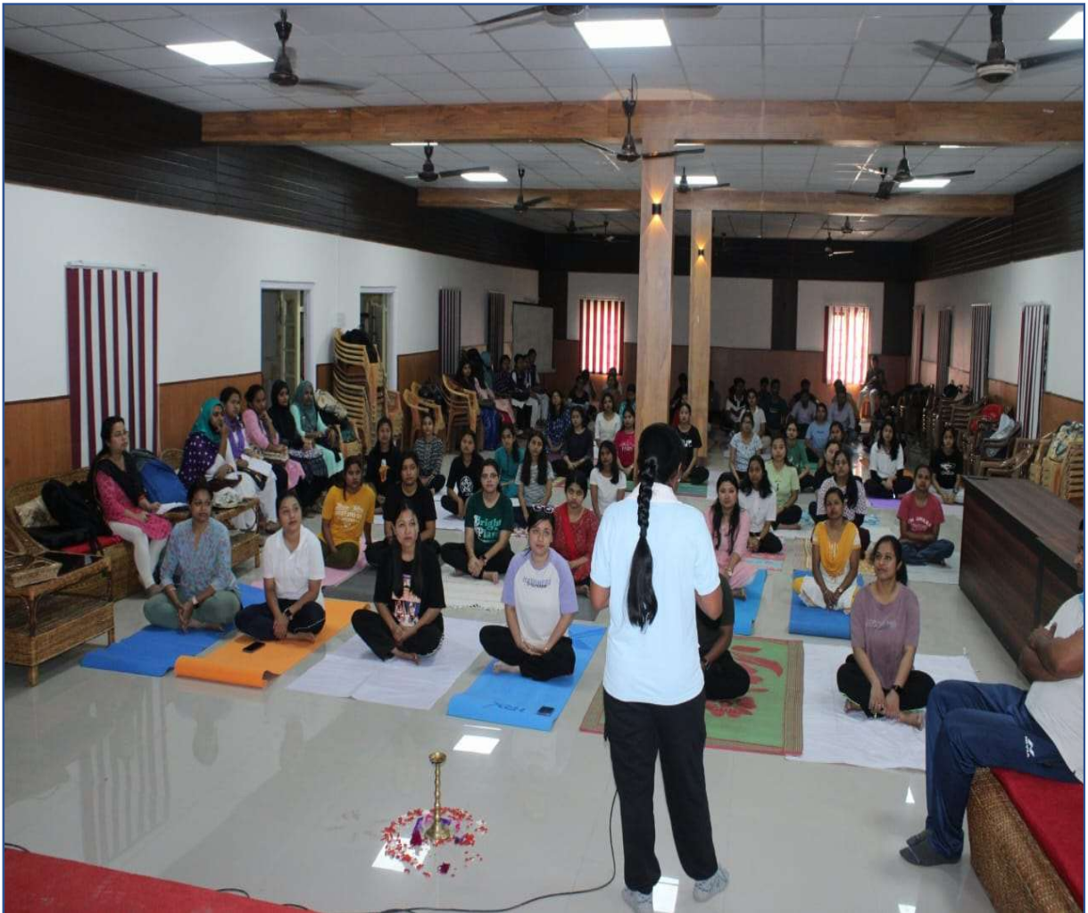
Students Performing Yoga

COLLEGE OF EDUCATION, NAGAON AFFILIATED TO GAUHATI UNIVERSITY, RECOGNIZED BY NCTE ACCREDITED BY NAAC (2014) ESTD:1992