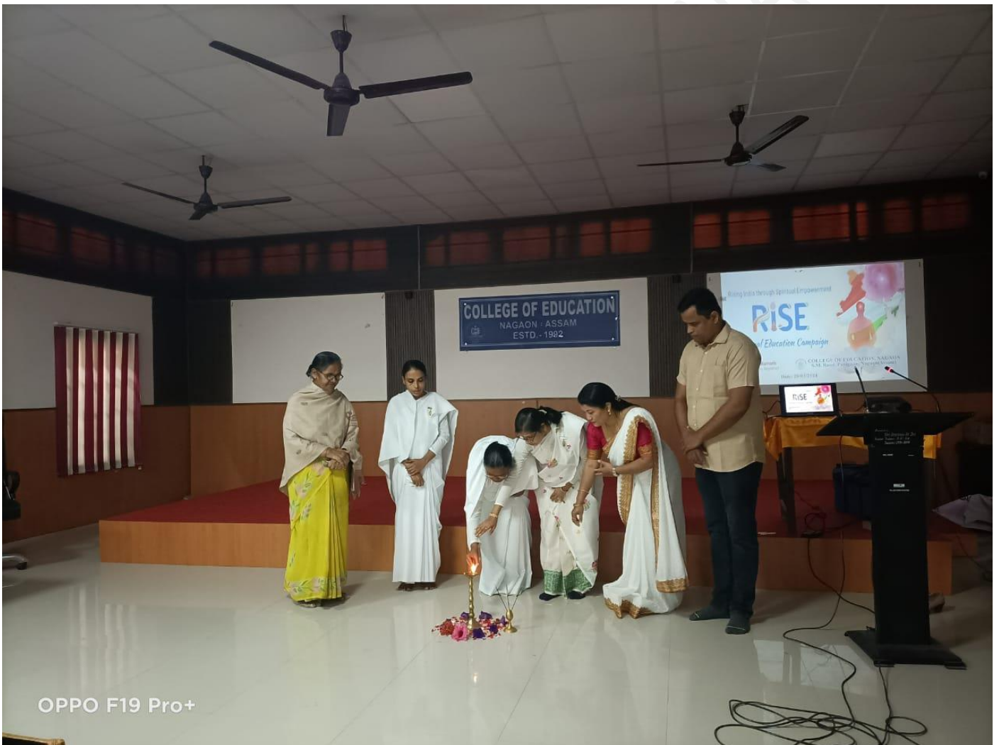
Opening ceremony of Workshop on Spiritual Upliftment