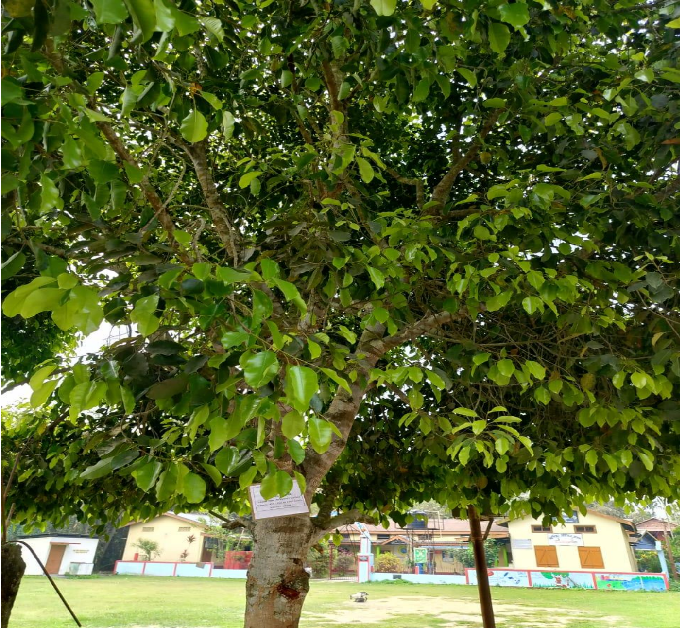
Tree plantation in Chakari Gaon, Nagaon

COLLEGE OF EDUCATION, NAGAON AFFILIATED TO GAUHATI UNIVERSITY, RECOGNIZED BY NCTE ACCREDITED BY NAAC (2014) ESTD:1992