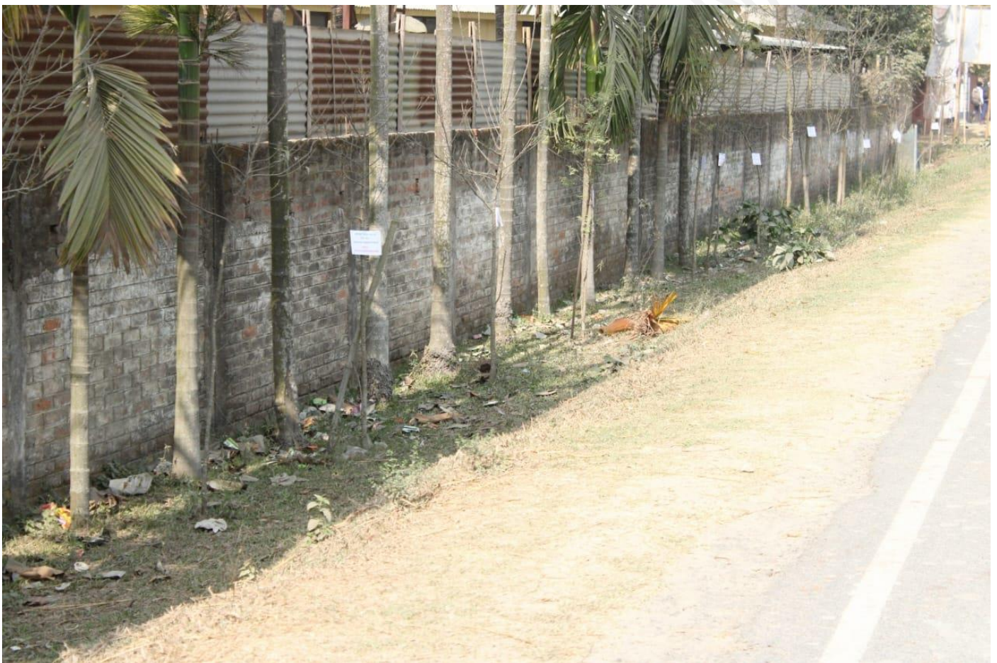
Tree Plantation in Barchapori Gaon