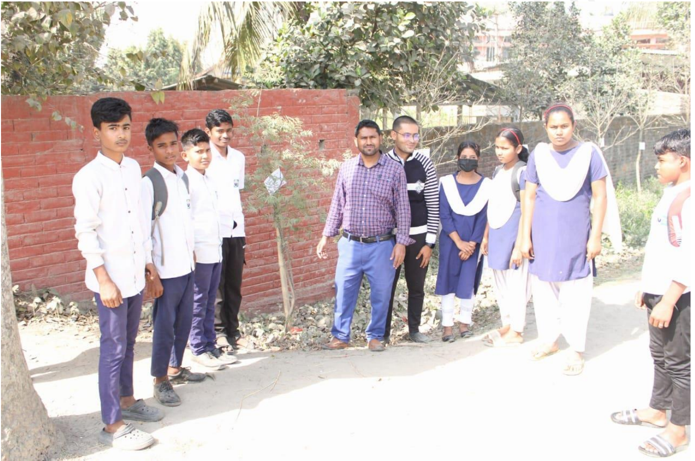
Tree plantation and maintenance by the students and Alumni of College

COLLEGE OF EDUCATION, NAGAON AFFILIATED TO GAUHATI UNIVERSITY, RECOGNIZED BY NCTE ACCREDITED BY NAAC (2014) ESTD:1992