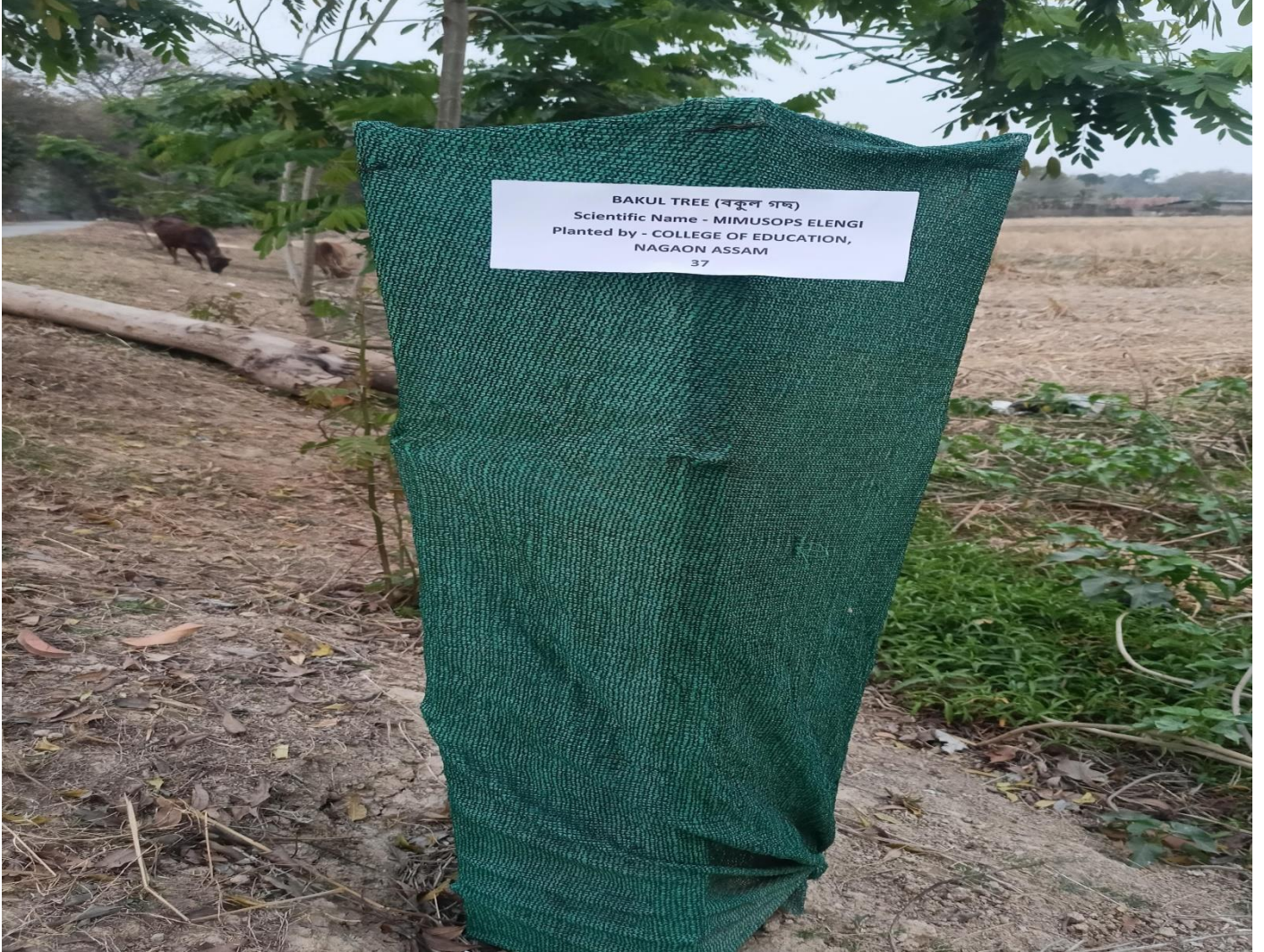
Tree plantation in Kampur