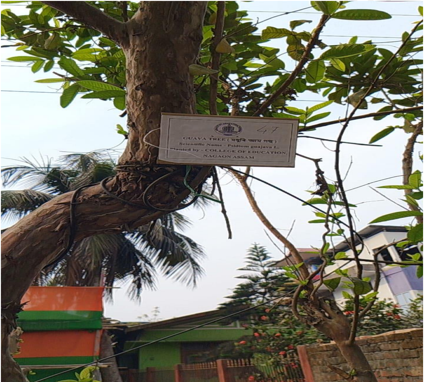
Tree plantation in Chakari Gaon, Nagaon