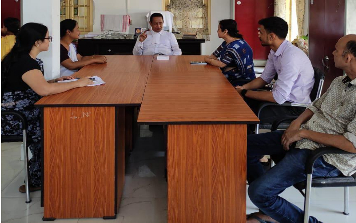
Meeting of Institutional Values and Best Practices, 2022-23

COLLEGE OF EDUCATION, NAGAON AFFILIATED TO GAUHATI UNIVERSITY, RECOGNIZED BY NCTE ACCREDITED BY NAAC (2014) ESTD:1992