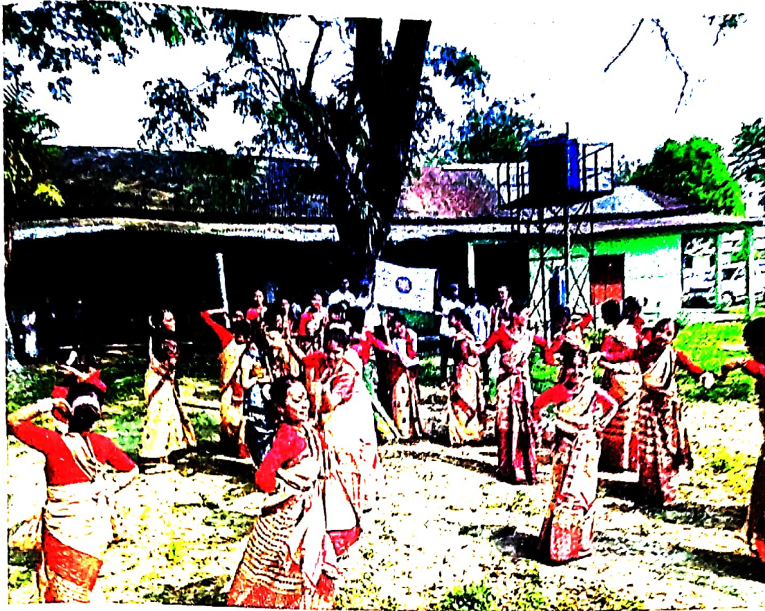
A picture of the bihu celebration at school

In short when students from different regions experience this joy of festivals, it truly enhances the Indian culture. The school thus believes that education will allow the child to bloom and thrive, giving them the right platform where they will work towards becoming a responsible citizen.